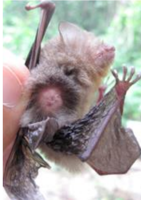
Kerivoula pellucida (Clear-winged Woolly Bat) carrying pup captured in Peninsular Malaysia.

Based on data from the Malaysian Meteorological Department, Peninsular Malaysia and East Malaysia are predicted to have warmer temperatures (increasing between 1.1 – 3.6°C and 1.0 – 3.5°C, respectively). Moreover, rainfall is predicted to be the most important variable associated with insect biomass during the peak lactation period in bats. Projections of rainfall in Peninsular Malaysia, predict that Western areas will receive more rainfall than the east.