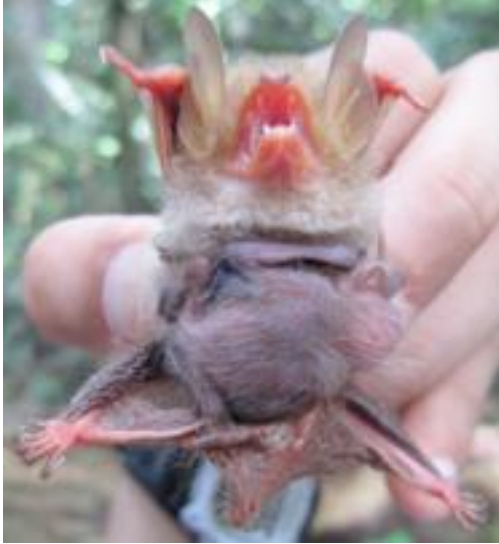
Lactating Kerivoula papillosa (Papillose woolly bat) captured in Peninsular Malaysia.

anthropogenic disturbance, will speed up the process and lead to the most critical outcome that we all worry—extinction.