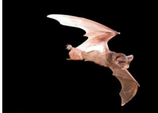
The range of the White-striped Free-tailed bat ( Austronomus australis ) may be limited by the bat's ability to dissipate flight muscle heat. This may result in future range contractions to the south-eastern corner of Australia, where it has been recorded recently expanding its range, credit: Terry Reardon.

There is more work ahead before we can understand bat responses to climate change and take necessary steps to conserving bats in a changing climate.