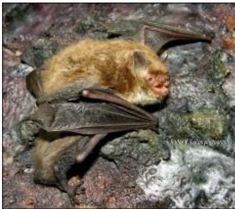
Female Myotis daubentonii lactating young

Climate change is becoming a top priority on the biodiversity conservation agenda. Little was known on the impact of climate change on bats 11 years ago and no major impact was proven, based on scarce evidence. Nevertheless, climate modelling is predicting range contractions throughout the 21 st century for the majority of bat species. Moreover, recent research showed a northward spreading of suitable climate for species that formerly occurred in southern areas. Ecologically flexible species, such as Pipistrellus kuhlii , P. nathusii and Hypsugo savii , may use new space in previously unoccupied areas for increasing their distribution range. However, roost specialist such as some cave-dwelling bats, could hardly undergo such large northward expansion because caves are absent or very rare in northern areas. These predicted range shifts will likely increase the fragmentation and isolation of populations.