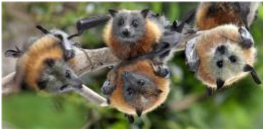
Dramatic increases in the number and severity of heat waves along the eastern coast of Australia have resulted in massive mortality events for flying foxes like the Grey-headed Flying-fox ( Pteropus poliocephalus ), credit: Viv Jones.

Climate change is one of the great biodiversity conservation challenges of our time. Bats are widespread, diverse and fill a range of trophic roles in ecosystems. Furthermore, their reproduction, roosting and foraging behavior are strongly linked to climate. Research into the effects of climate change on bats is still sparse, though the number of studies has increased greatly in the past 5 years.