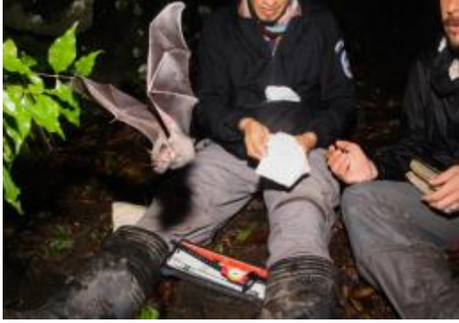
Release of Artibeus jamaicensis , bat that may have disappeared from the lowlands under climatic change scenarios RCP 4.5 to 2050.

unable to adapt to new conditions, nearly 31.6% of the species will lose 80% of the current distribution, and at least five species will lose 98% their actual range. Moreover, the thermal niches of lowland species are narrower than those of highland species. Because of CC, species from lowlands could shift their distribution to higher altitudes, leading to biotic attrition in lower areas, and increasing competition with species of medium-high areas. This will lead to declines in populations of specialist species in highlands. A study in Costa Rica shows an altitudinal increase in the range of bat species associated with lowlands, as well as an increase in altitudinal migrations of species associated with medium and high elevations. Moreover, six species showed a reduction of 60-85% of the area they can potentially occupy by 2080.